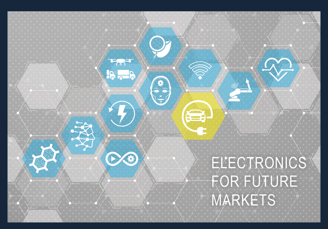
Added value guided by the question how our customers become and remain valuable partners for their customers.

The need for competitive advantage characterizes tomorrow's future mobility industry – OEMs as well as further market participants of the whole ecosystem. Especially for the mobility sector, the Automotive Business Unit (ABU) contributes the comprehensive industry network and valuable know-how to holistic solutions at application level. Together, this makes all the difference in solving future challenges in the disruptive automotive world of tomorrow!