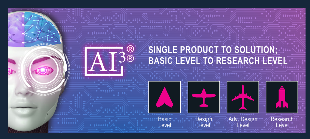
Innovation and Future DNA

Under the label of Rutronik System Solutions our experts focus their life-long experience, competences and comprehensive product knowledge. Rutronik System Solutions combine the best products based on their features and performance aiming at creating innovative and best-in-class solutions. Thus, we decisively shorten the time-to-market in dynamic industrial environments. Customers gain the necessary decision-making freedom in the research and pre-development phase and a time advantage over competitors.