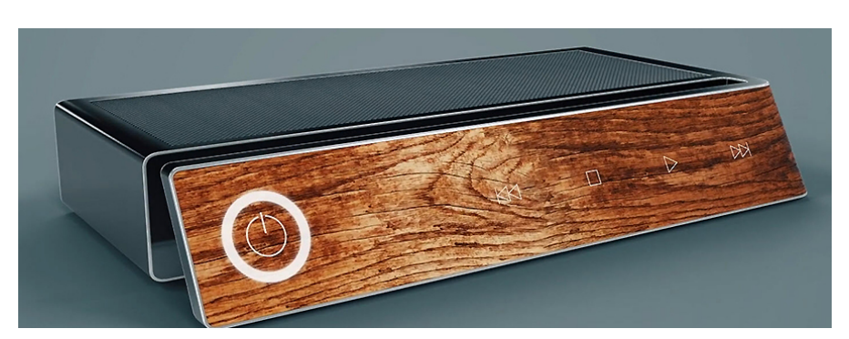
Real wood as a user interface for a consumer product? No problem. The CHS can handle that task as well