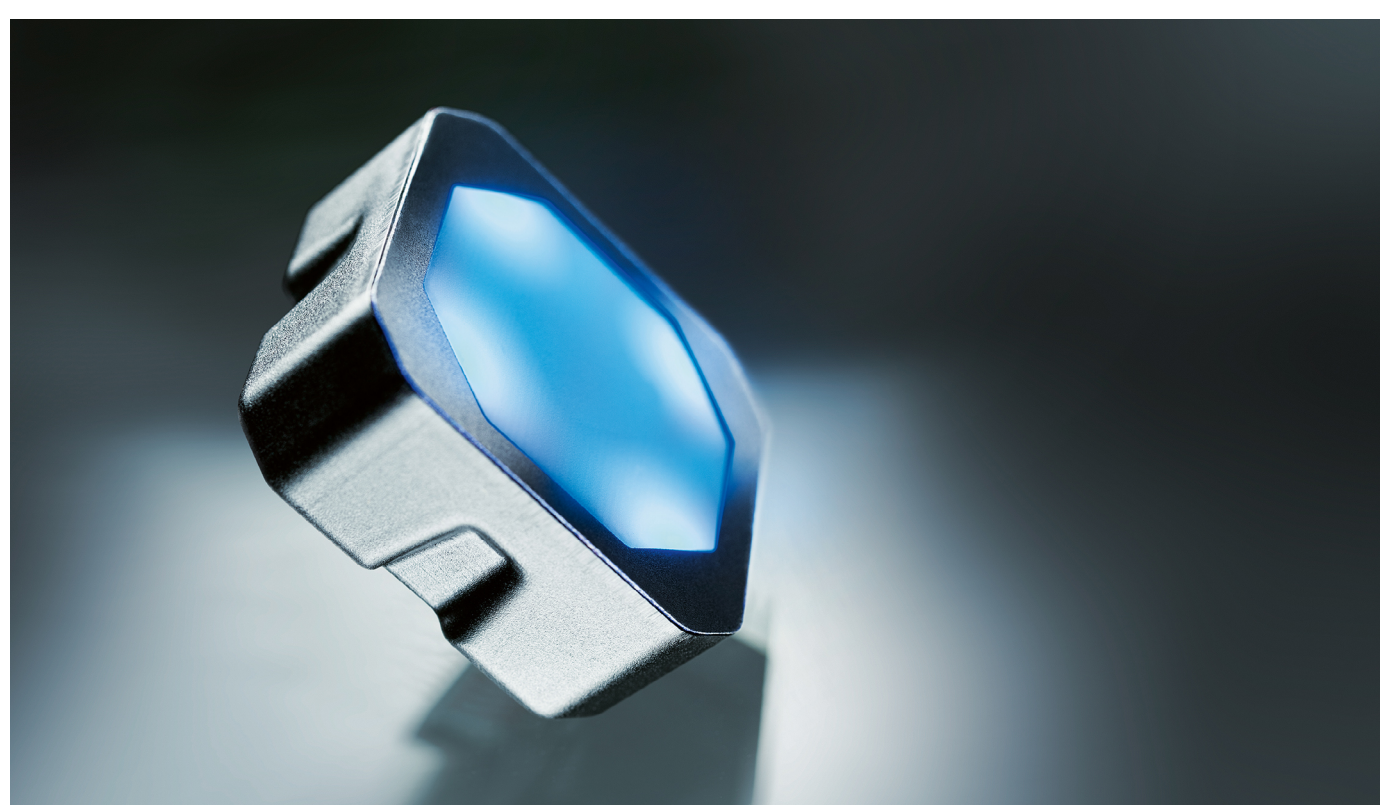
SCHURTER CHS 1: capacitive switch for invisible installation with surface illumination

The integration of switches in user interfaces usually requires milling or drilling. Today, certain applications, especially those that are highly sensitive to hygiene or particularly demanding in terms of design, often want to avoid this. And it is precisely for this purpose that SCHURTER has created a new line of switches.