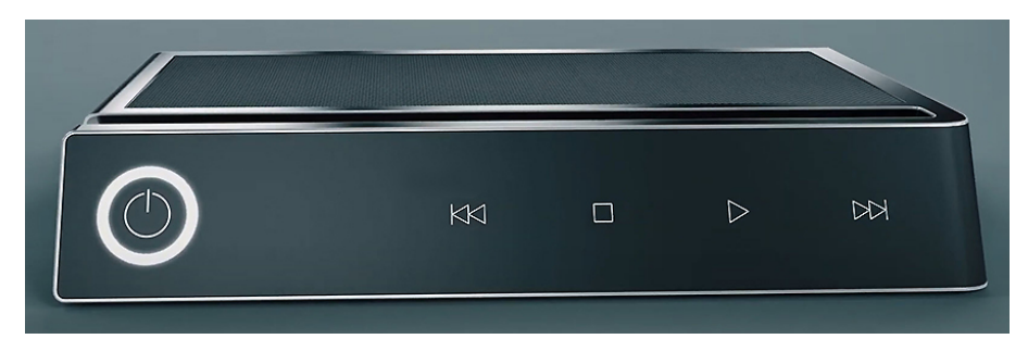
No gap, no openings: ultra-hygienic, translucent user interface for medical technology or the food industry

This is where the new SCHURTER CHS comes into play. The switch can simply be glued behind the front panel of the user interface. The illuminated CHS switches are particularly suitable for translucent operating surfaces such as glass or plastic. The ultra-hygienic user interface is ready.