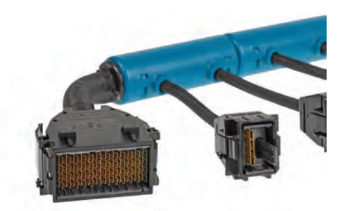
Impel Open19 Cable