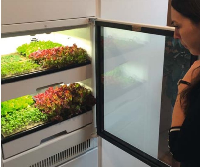
Multilayer cultivation: OSCONIQ® P 2226