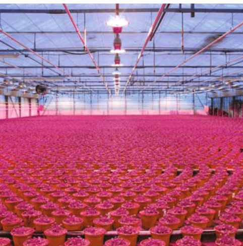
Horticulture top lighting: OSLON® family