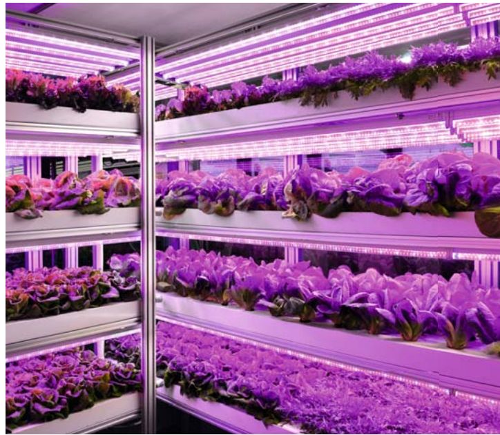
Vertical farming: OSCONIQ® P 2226