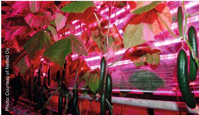
Interlighting: OSCONIQ® P 2226