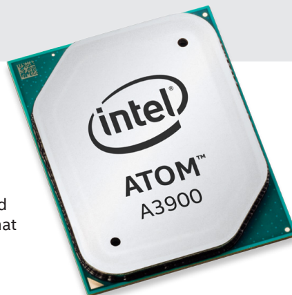
Intel® Atom™ automotive processors for in-vehicle experiences

The new Intel Atom automotive processors enable automakers and suppliers to build in-vehicle experience (IVE) solutions with Intel's enhanced security features and a scalable architecture with interchangeable platforms that they can use for many model years to come.