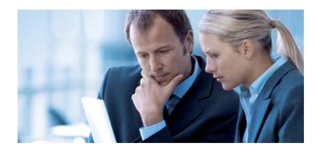
We ensure that all items are shipped to the same accustomed quality standards worldwide.