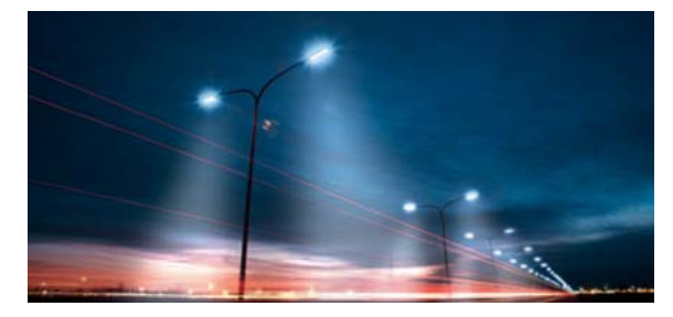
Illuminating visions: LED street lights.