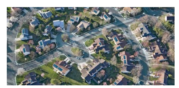
We set standards in the photovoltaic field.

Those are just some of the projects by which we are helping to point the way forward along the path to technical advancement. Come along and join us on it.