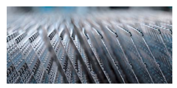
BEK-Systemtechnik - The specialist in production electronic modules and devices