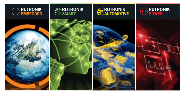
RUTRONIK Innovation Centers