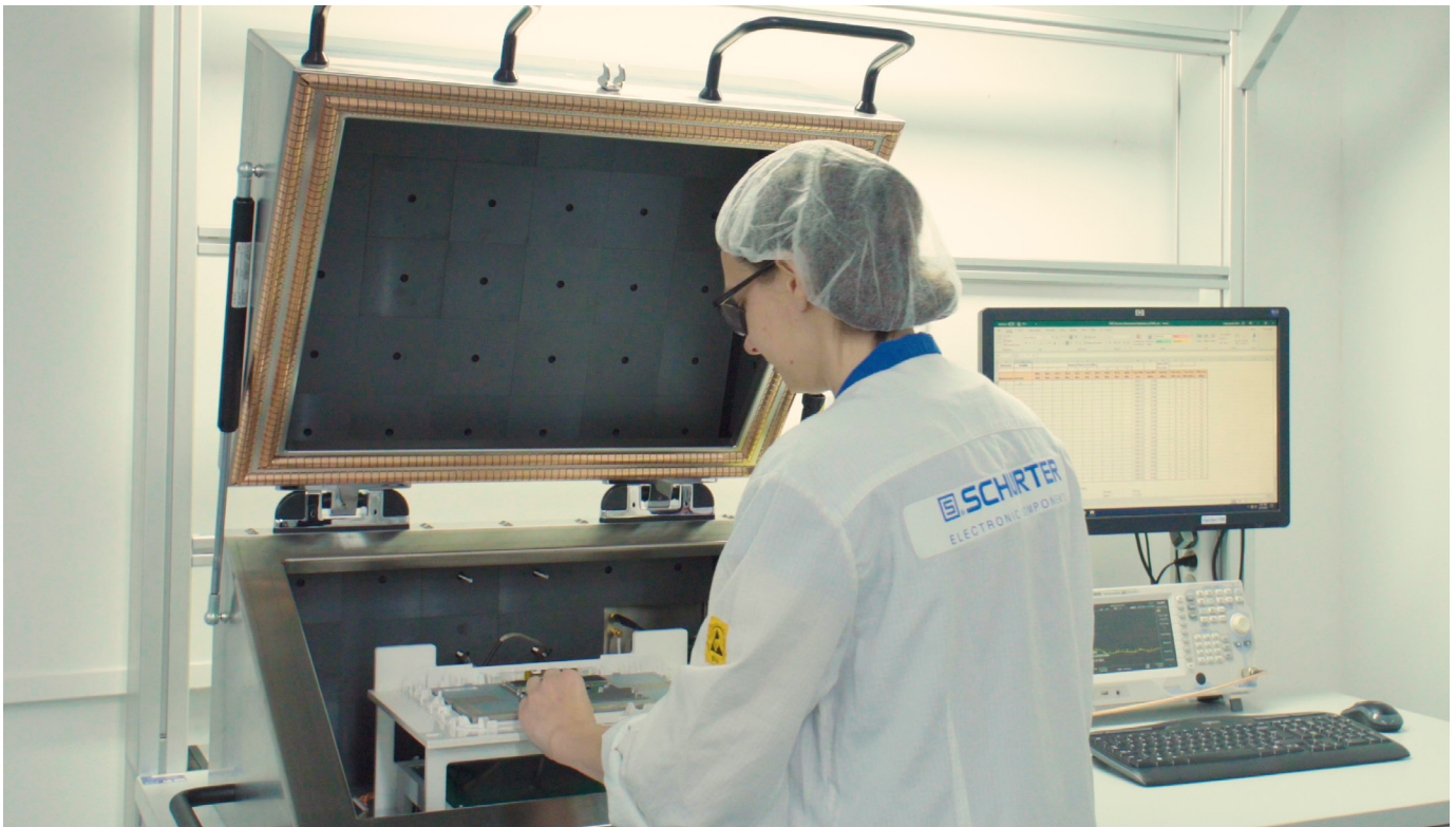
Safe medical applications thanks to SCHURTER expertise

Electromagnetic compatibility (EMC) is not only mandatory in medical technology. If wireless communication between medical applications gets disrupted, it can have serious consequences for the patient. SCHURTER works together with developers in the medical industry to develop applications that comply with the strictest EMC standards.